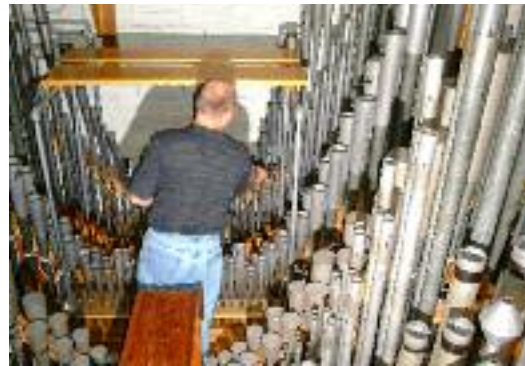
Tuning some of the 4490 pipes in the organ. These are in the Solo (right) chamber

The instrument has been carefully maintained and enlarged over the years until there are now 3 chambers, 66 ranks of pipes, 11 tuned percussions, a multitude of drums, cymbals, and sound effects. It now boasts of 2 consoles, each with 3 manuals (keyboards).