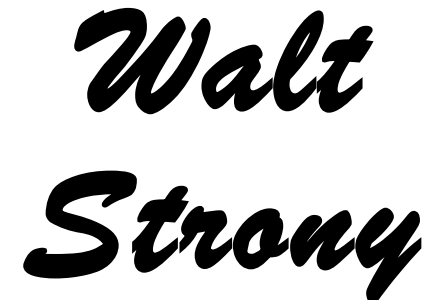
Live Concert Saturday, November 20, 2021 at 7:00pm

a Chapter of the American Theatre Organ Society presents